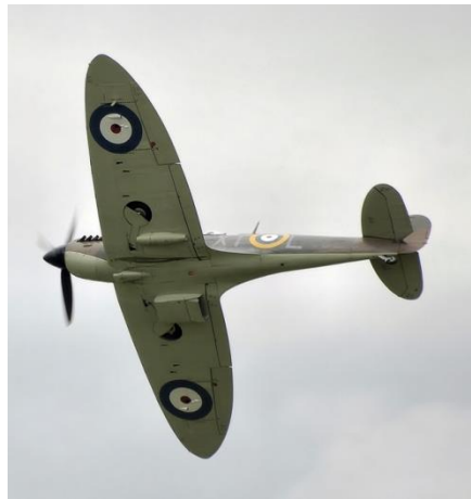
The only Supermarine Spitfire that flew during the Battle of Britain and is still airworthy today is this Mk IIA. The Spitfire became the stuff of legend during the difficult days of the Battle of Britain.

The advantage of radar combined with the excellent climbing characteristics of the Hurricane and Spitfire allowed the British the comfort of being not only in the right spot to intercept, but also at the proper altitude or, if they were lucky, higher. British response tactics were modified by Douglas Bader and Trafford Leigh-Mallory to accommodate the Big Wing theory, which inflicted heavy casualties on the Luftwaffe. Eventually this tactic was adopted as official doctrine.