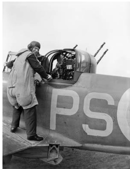
Preparing to enter the gun turret of his Boulton Paul Defiant Mark I fighter at its base at Kirton-in-Lindsey, Lincolnshire, a gunner of No. 264 Squadron, RAF, smiles confidently over his shoulder. The Defiant was obsolete by the time this photo was taken in August 1940.

The Boulton Paul Defiant first appeared in May 1940. Its top speed was 303 mph, and its four machine guns were located in a manned turret immediately aft of the cockpit. This arrangement made it impossible to attack a target in front of the aircraft, as it had no fixed forward firing armament. The turret had been placed in a defensive position.