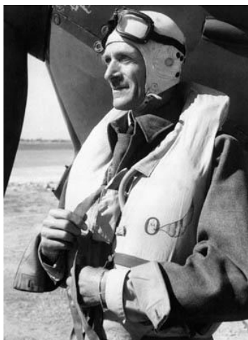
Shown in flight gear before taking off from an airfield on the island of Malta, Air Vice Marshal Sir Keith Park, a New Zealander, played a prominent role in managing Britain's fighter defenses against the onslaught of the German Luftwaffe

From the outset Trafford Leigh-Mallory and Keith Park did not see eye to eye. Park, who flew his personal Hurricane to check up on his pilots in combat, commanded 22 fighter squadrons over the most important area of the country. Leigh-Mallory was assigned to support Park, and his 14 squadrons would cover 11 Group's bases when they went up after the German raiders. Because 11 Group's area was closer to the French coast and held the priority targets, logistics made it more reasonable for Park's fighters to be the first wave of attackers. Nevertheless, this created animosity among Leigh-Mallory, Park, and Dowding. The approaches each man took to thwart the Luftwaffe would directly affect the outcome of the battle.