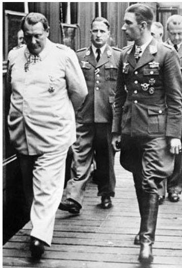
Lieutenant Colonel Werner Mölders, an early German fighter ace, confers with Reichsmarshal Hermann Göring during the Battle of Britain.

Göring hopelessly clung to his admiration of the Bf-110, despite the obvious fact that single-engine fighters were vastly superior. Eventually, Bf-110s were escorted by Bf-109s, fighters escorting fighters. This illustrates just how far removed Göring was from the fighting, compared with Keith Park who was flying sorties in his personal Hurricane.