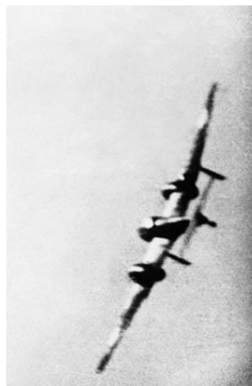
Gun camera footage from the Spitfire flown by Pilot Officer M.E. Staples shows a German Messerschmitt Me-110 fighter frantically banking to port to elude the British pilot’s machine-gun fire. Staples, a pilot of No. 609 Squadron, was one of those who proved the superiority of the Spitfire against most German bombers and twin-engine fighters during the Battle of Britain.

The reason for the effectiveness of RAF interceptions of German bombers was quite simple. The British radar system worked incredibly well. Beginning in the early 1930s, Britain had experimented with radar, and by 1938 the system was so advanced that it could report size, speed, altitude, heading, and whether or not the plane was friendly. The Germans knew about the British radar but chose to ignore it. The towers at Dover could be seen from the French coast. This proximity gave the Germans the false hope that the bombers, even though they showed up on radar, would be able to attack their targets before the information could be passed through the proper channels.