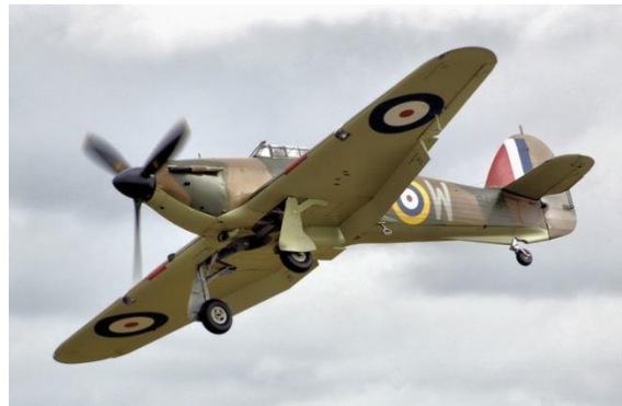
The only Hawker Hurricane from the Battle of Britain still flying today is this Mk 1, which flew 49 combat sorties from its base at Croydon, England. Its pilots destroyed three enemy aircraft and damaged two others.

The fighting did not end on September 15, although it soon became recognized as the day the Luftwaffe lost the Battle of Britain. As for Operation Sea Lion, the proposed invasion of Britain, Hitler postponed it indefinitely. London would suffer from the Blitz as bombing raids continued throughout October. Historians often cite October 31 as the date on which the actual Battle of Britain concluded. RAF losses were 1,017 planes and 537 pilots in Fighter Command and 248 planes and nearly 1,000 men from Bomber and Coastal Commands. The Luftwaffe lost 1,733 planes and nearly 3,000 crewmen.