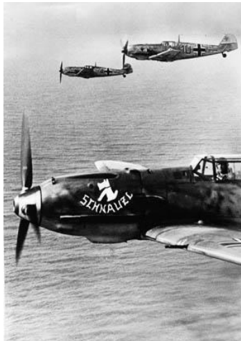
Heading for the coast of England in September 1940, a squadron of German Messerschmitt Me-109 fighters prepares to do combat with the Royal Air Force for supremacy of the air.