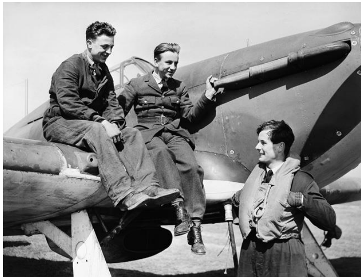
Squadron Leader Peter Townsend chats with two ground crewmen as they sit jauntily atop the wing of his Hawker Hurricane fighter based at Wick, Scotland. The Hurricane proved more effective against German bombers, while Spitfires attacked the enemy fighters during the Battle of Britain.

The difficulty in shooting down a German bomber owed to the inadequacy of the .303 round and to the self-sealing fuel tanks found in German aircraft. The self-sealing tanks worked by employing two layers of metal divided by a special rubber compound. When the tank was punctured, the fuel reacted with the rubber, causing the compound to swell and close the hole. This was only a temporary fix, which would allow the plane to return to base without losing appreciable fuel or bursting into flames.