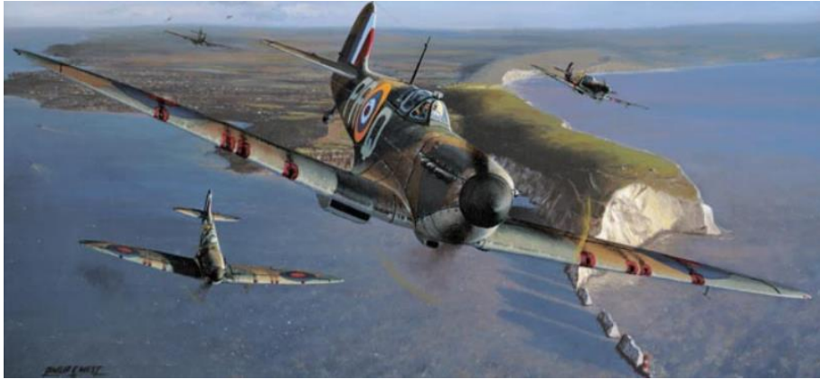
The British Royal Air Force saved its island nation from invasion during the dark days of 1940 and the Battle of Britain.

It was a battle fought without armies. No rifles, no tanks, no barbed wire. In the summer of 1940, the skies above Britain served as the battlefield for the British Royal Air Force and the German Luftwaffe. The Nazis had conquered most of Western Europe, and Britain stood alone. The Luftwaffe represented the first arm of the German military juggernaut to take a swing at the British Isles. Its mission was simple: repeat the performances in Poland and France and eliminate the enemy air force. This would facilitate an invasion, which the Germans had no reason to believe would fail.